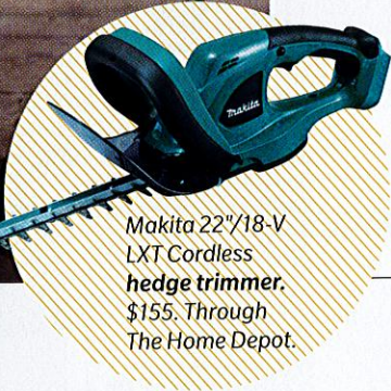
Makita 22"/18-V LXT Cordless hedge trimmer. $155. Through The Home Depot.